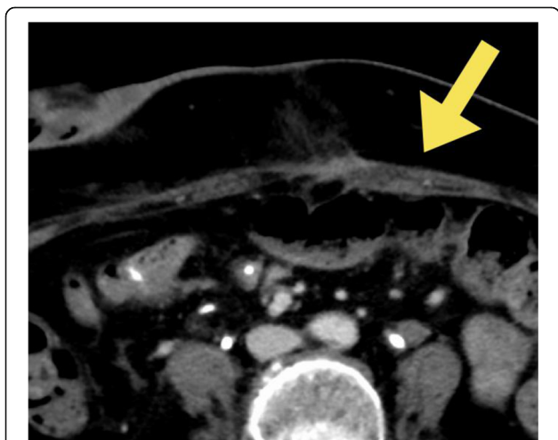
Fig. 1 Enhanced abdominal CT on POD 16. The figure shows an enlarged left rectus abdominis with inhomogeneous contrast

On POD 4, she complained of severe abdominal pain (numerical rating scale (NRS) score: 10/10) 40 min after removal of the epidural catheter. She was unable to walk or eat despite pain relief provided by intravenous infusion of acetaminophen and NSAIDs. On POD 12, computed tomography (CT) showed a hematoma extending from inside the rectus muscle to subcutaneous tissue, and the surgeon started to administer tramadol (50 mg/day). On POD 16, CT showed that the size of the RSH was unchanged (Fig. 1), and the NRS score was high (resting: 2/10, moving: 10/10). The anesthesiologists were consulted regarding pain management. On POD 17, a rectus sheath catheter was placed under ultrasound guidance. A high-frequency linear probe was placed transversely with the rectus muscle immediately lateral to the umbilicus. An 18-G Tuohy needle