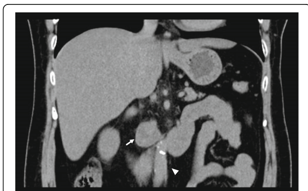
Fig. 1 Coronal noncontrast computed tomography image. A heterogeneous mass in the right retroperitoneal region (white arrow) adjunct to the inferior vena cava (white arrow head) is demonstrated

The overall incidence of pheochromocytomas is 0.8 per 100,000 [10], and approximately 15–20% of them arise from the extra-adrenal chromaffin tissue [11]. Patients with retroperitoneal pheochromocytomas commonly present with symptoms similar to intra-adrenal pheochromocytomas such as diaphoresis, headache, and palpitations along with hypertension [12]. In the present case, hypertension