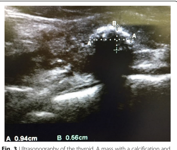
Fig. 3 Ultrasonography of the thyroid. A mass with a calcification and an acoustic shadow is observed in the thyroid