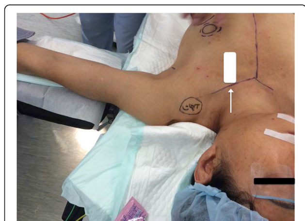
Fig. 1 Probe's method. A probe is a white box, and the injection site is a white arrow

There have been no reports in the literature on the use of selective supraclavicular nerve block in clavicle fractures. Therefore, it is uncertain whether adequate anesthetic volumes and concentration would achieve a satisfactory result. In particular, administering a small volume at the site may not be able to block lateral supraclavicular nerves.