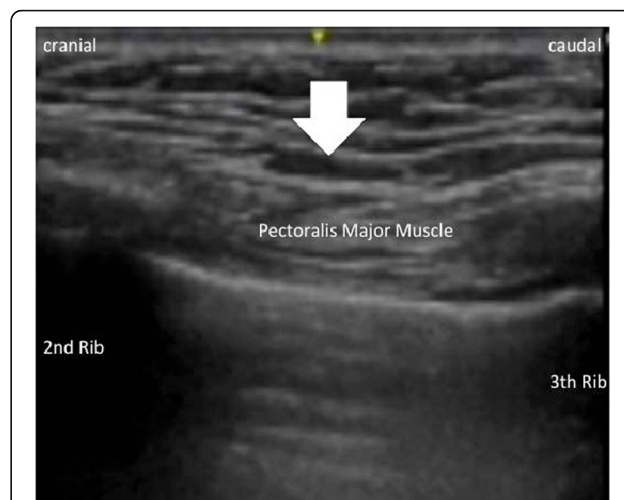
Fig. 2 An ultrasound image of the selective supraclavicular nerve block. An injection point is a white arrow

The supraclavicular nerve arises from the third and fourth cervical nerves and emerges beneath the posterior border of the sternocleidomastoid muscle. The supraclavicular nerve branches into the medial, intermediate, and lateral supraclavicular nerves at the sternocleidomastoid and descends into the posterior triangle of the neck beneath the platysma and deep cervical fascia (Fig. 3) [2]. These branches run parallel beyond the pectoralis major muscle. In this case, we selectively blocked the supraclavicular nerve by injecting local anesthetic at the site of the pectoralis major muscle. The selective supraclavicular nerve block reported by Valdés-Vilches and Sánchez-del Águila [3] is performed via the supraclavicular approach and has the risk of phrenic nerve block if more than required volumes are injected.