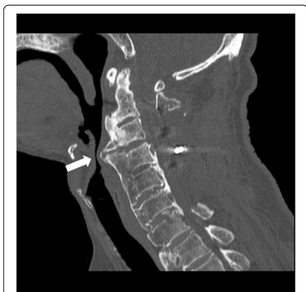
Fig. 2 Sagittal CT showing overhang of posterior hypopharyngeal wall by osteophytes (white arrow) in a 69-year-old man

Furthermore, osteophytes are likely to be missed in routine airway examination by frontal radiography. Therefore, it is necessary that preoperative radiography is evaluated including the lateral view, if the patient has diagnosis of OALL. And airway management of OALL patients needs careful consideration and modifications