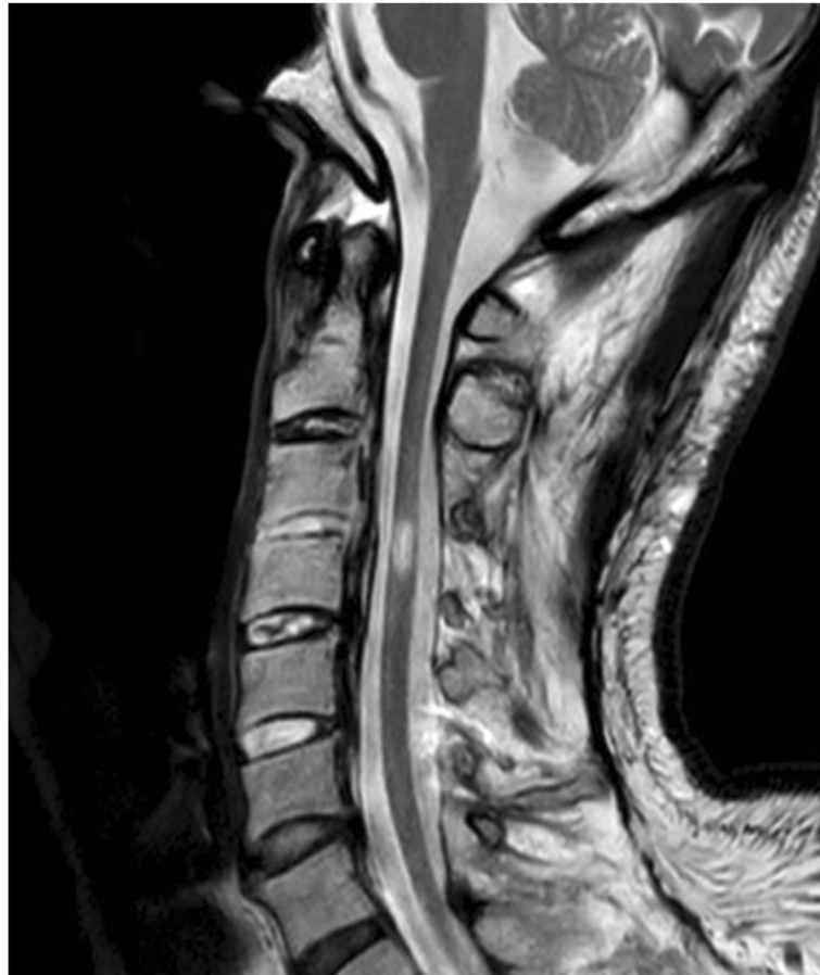
Fig. 1 A cervical spine sagittal T2-weighted magnetic resonance image showing a C3–C4 spinal cord lesion

assistance with activities of daily living such as feeding and cleaning himself. He had paresthesia in C5–Th3 and sensory paralysis below T4. Manual muscle testing of the bilateral biceps and deltoid muscles revealed scores of 2–3/5, and his lower extremities showed complete paralysis. Muscle atrophy and edematous change were observed in his bilateral upper extremities. Magnetic resonance imaging (MRI) of the cervical spinal cord revealed a high-intensity lesion in the C3–C4 spinal cord (Fig. 1). Although a T1 transforaminal epidural block reduced his pain to NRS 4, the effect was temporary. Therefore, his pain was considered an at-level SCI neuropathic pain, entailing both peripheral and central neuropathic pain. This patient was deemed a good candidate for SCS; therefore, we opted to perform an SCS surgical trial and implantation, and two 8-electrode epidural trial leads (Vectris™ SureScan™ MRI percutaneous leads, Medtronic Inc., Minneapolis, MN, USA) were implanted. Epidural access was obtained at the T6/7 interlaminar space. We had planned to position the tip of the leads at the target cervical dorsal column to obtain paresthesia in the painful region; however, the lead tips were placed at T1 because