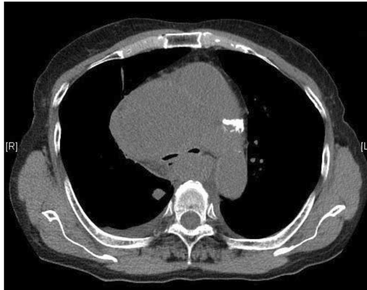
Fig. 2 Preoperative chest computed tomography at the level of the main bronchus. Bilateral main bronchi were remarkably compressed by the anterior mediastinal tumor

The patient was transferred to the intensive care unit where she remained sedated with intravenous dexmedetomidine and fentanyl until the next morning. After recovering from sedation, the patient's trachea was extubated. Her respiratory status had improved dramatically, which permitted her to lie in a supine position without dyspnea. She underwent chemotherapy after the procedure, but the tumor continued to grow. Based on the results of the biopsy and tumor marker values, a diagnosis of extragonadal primary germ cell tumor was