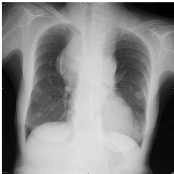
Fig. 1 Chest X-ray before the procedure

She was not administered with any anesthetic premedication and was placed in the left lateral decubitus position for surgery. The patient was monitored via