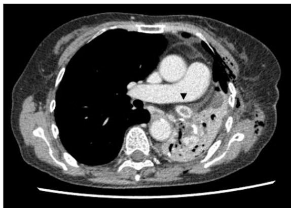
Fig. 3 Contrast-enhanced computed tomography showing a thrombus in the left upper pulmonary vein stump in case 3 (arrowhead)

We report three patients who underwent VATS for left upper lobe and developed thromboembolic complications. The patients in case 1 and case 2 developed life-threatening massive cerebral infarction without obvious cues of PVT. They had no clinical manifestation of perioperative atrial fibrillation, which is one of the major causes of stroke. Clinicians should consider PVT when patients present with cryptogenic stroke or systemic emboli after VATS-LUL [1, 2]. An early definitive diagnosis is critical to rescue the patient and to prevent severe complications. The patient in case 3 had asymptomatic