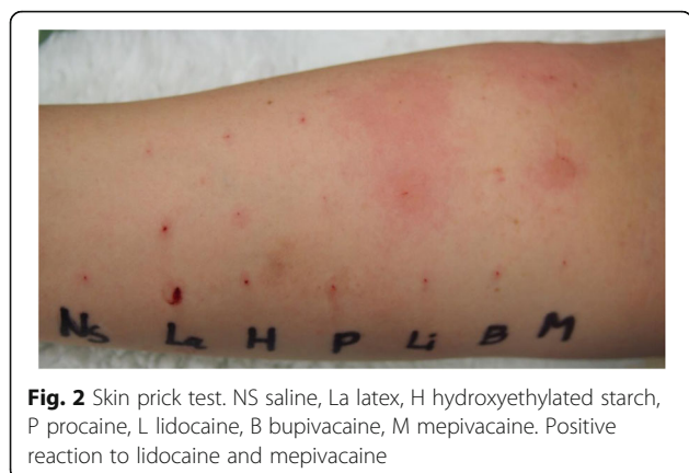
Fig. 2 Skin prick test. NS saline, La latex, H hydroxyethylated starch, P procaine, L lidocaine, B bupivacaine, M mepivacaine. Positive reaction to lidocaine and mepivacaine