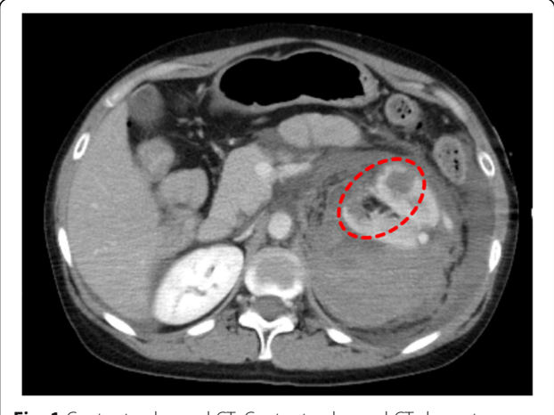
Fig. 1 Contrast-enhanced CT. Contrast-enhanced CT shows two potential sites of intrarenal rupture of arteries (circle)

After admission to the intensive care unit (ICU), no signs of hemorrhage were seen and the patient remained stable. Her trachea was extubated 2 h later, and she was discharged from the ICU on postoperative day (POD) 1. The mother continued to have a fever of 38 °C for 2 weeks, and infection from retroperitoneal hematoma was suspected, although blood culture yielded negative results. Sulbactam and ampicillin were administered. Hospitalization was extended for another few days to ensure everyday life did not cause re-expansion of the hematoma. She was discharged from hospital on POD 22. Back pain persisted for 2 weeks postoperatively, but was relieved using a nonsteroidal anti-inflammatory drug. No renal dysfunction was seen after performing TAE. Blood pressure was well-controlled at the time of