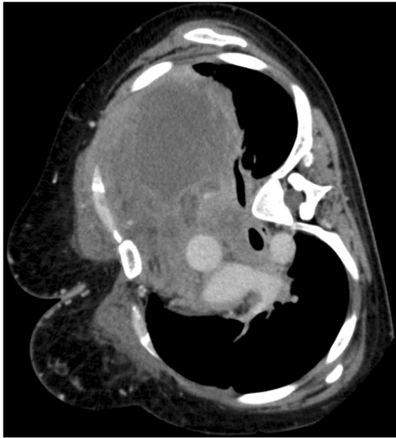
Fig. 1 Computed tomography scan below the level of carina, which was taken on day 2 after admission, showing severe obstruction of the left main bronchus

pericardial effusion was reduced. Oxygen flow rate was decreased from 4 to 1.5 L/min to maintain a SpO_2 > 98\% , and she was occasionally able to sleep in the supine position at night without dyspnea.