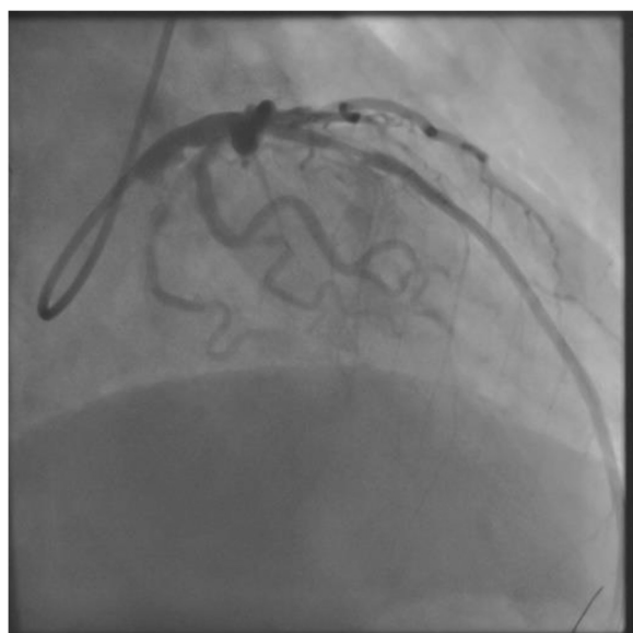
Fig. 4 Coronary angiography in the right anterior oblique position during recanalization, showing the obstructed region in the placed drug eluting stent

(MACE) was significantly higher (10–15 %) during the first 30 days after the stent implantation [3]. In our case, placement of a DES was the primary issue for the patient, who urgently required tracheostomy because of airway narrowing. The discontinuation of antiplatelet therapy shortly after the myocardial infarction and DES placement induced the SAT, which was the secondary issue.