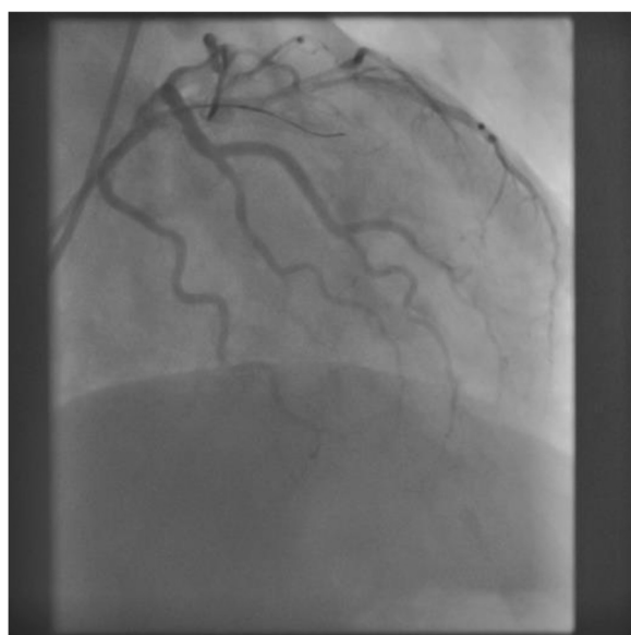
Fig. 3 Coronary angiography in the right anterior oblique position after the surgery, showing the left coronary artery and obstruction of segment 6

(MACE) was significantly higher (10–15 %) during the first 30 days after the stent implantation [3]. In our case, placement of a DES was the primary issue for the patient, who urgently required tracheostomy because of airway narrowing. The discontinuation of antiplatelet therapy shortly after the myocardial infarction and DES placement induced the SAT, which was the secondary issue.